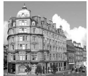
Unacceptable, Neglected and Derelict