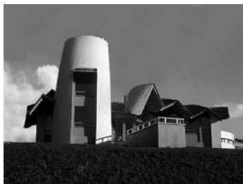
2004 Awards winner

Its influence depends on the breadth and depth of its membership whose commitment would show that they cared about Dundee and wished to improve it.