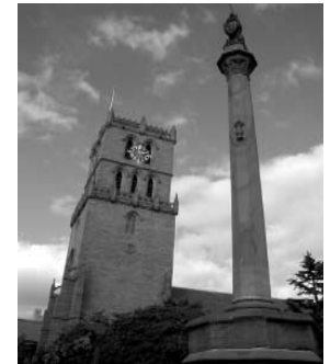
Your Architectural Heritage