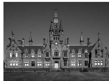
2005 Awards winner