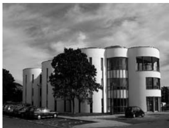
2006 Awards winner