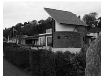
2007 Awards winner