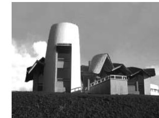
Annual Awards for Excellence